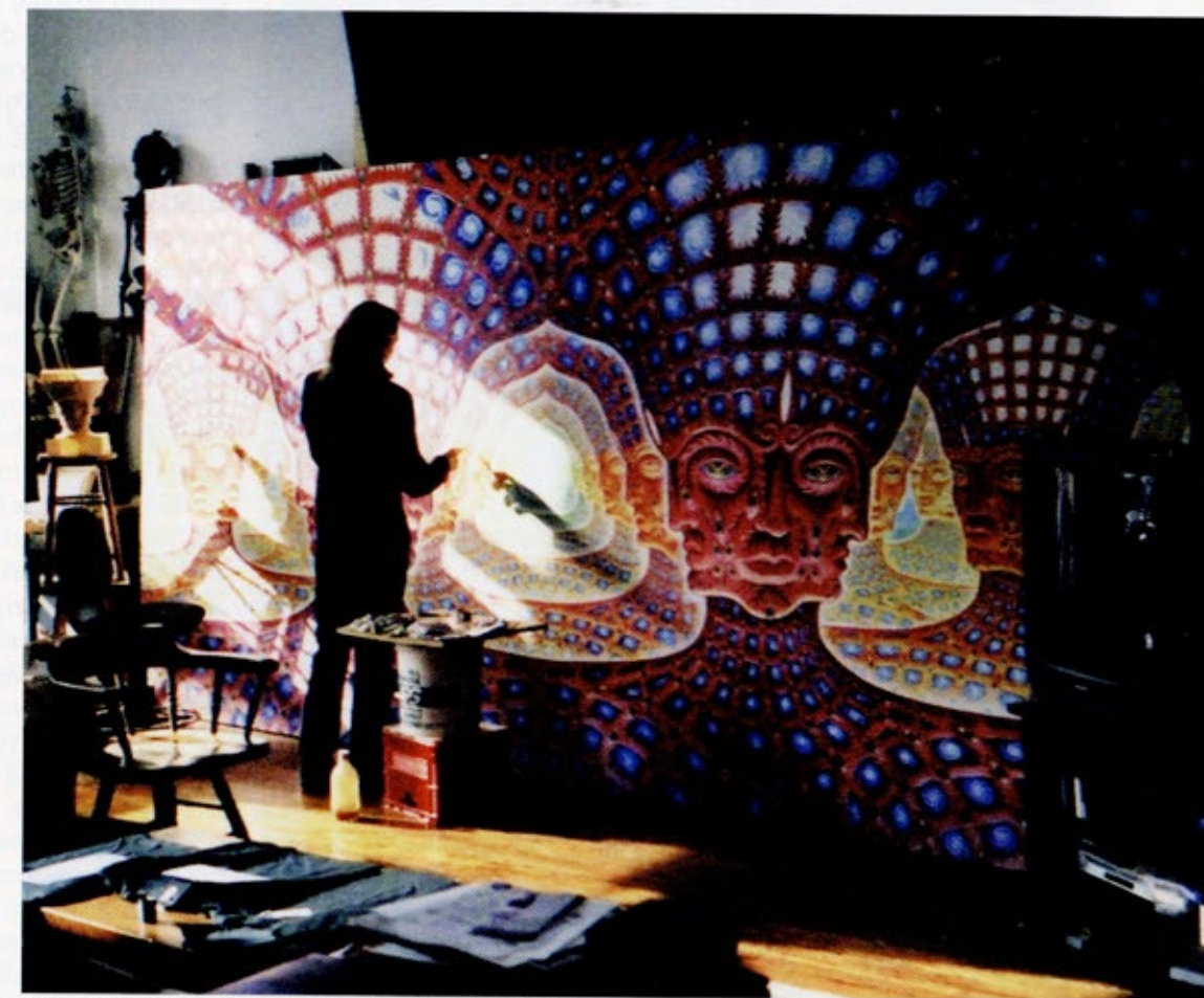
Painting Net of Being in studio, Brooklyn, New York, 2004

"As we evolve toward global consciousness, the Net of Being icon is offered as a symbol of the newly emergent networked self."