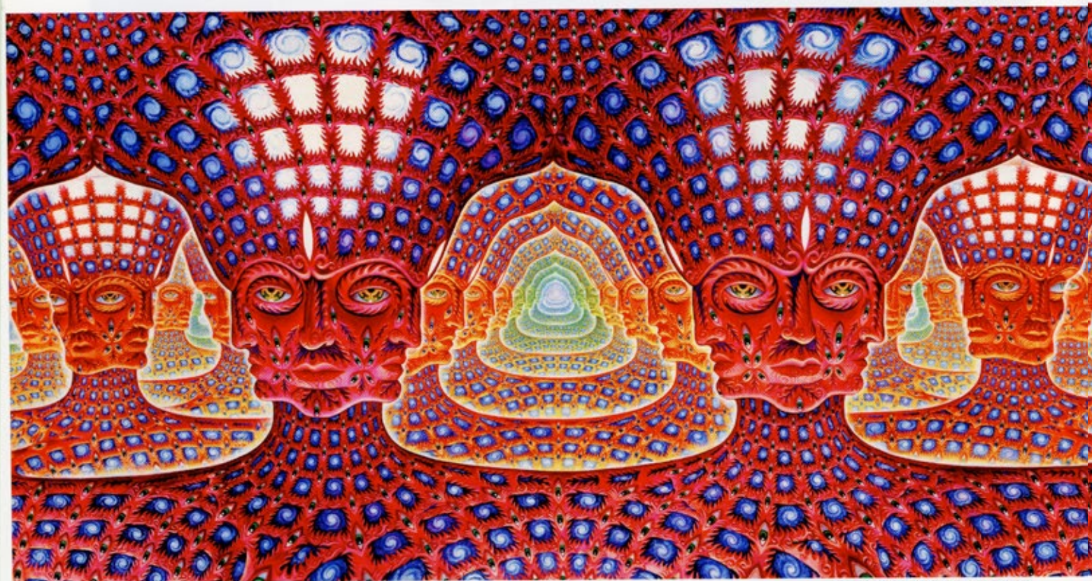
Net of Being, 2002-7, oil on linen

our comprehension of the vastness of the cosmos. An entire genre of "Cosmic Art" developed in the twentieth and twenty-first centuries by artists who consciously aligned themselves with the force that moves the stars.