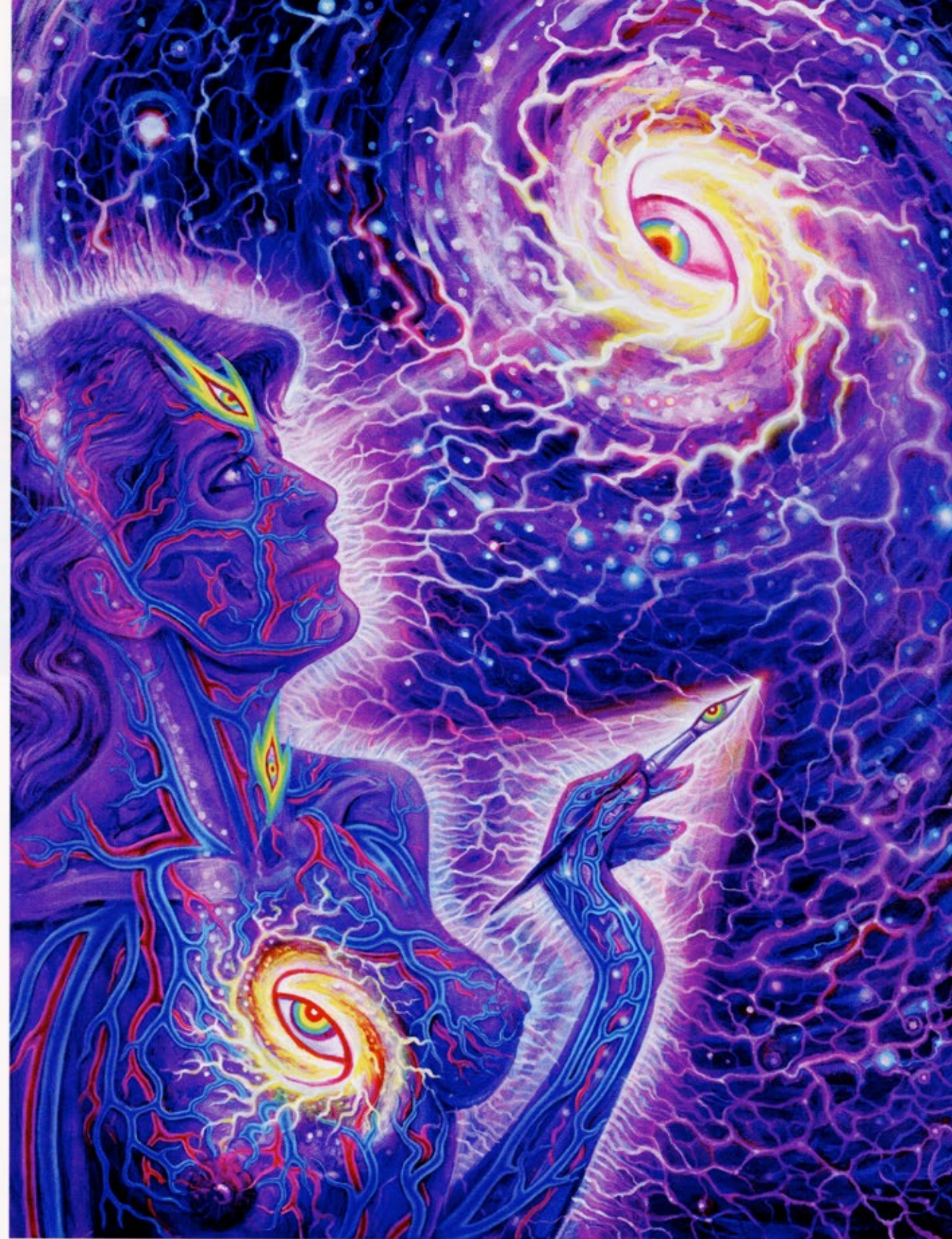
Cosmic Creativity, 2012, acrylic on canvas.

www.alexgrey.com www.allysongrey.com www.cosm.org